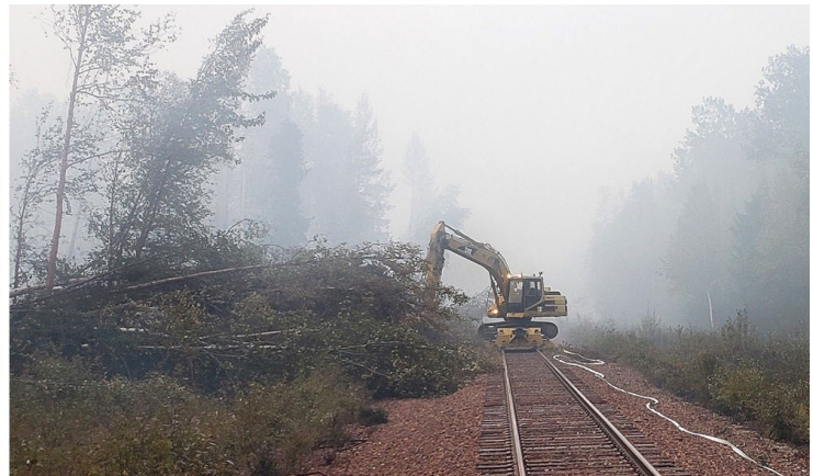
Railroad tracks run through the McKinley Fire burning in an area between Willow and Talkeetna. Railroad crews are assisting, by clearing trees along the right-of-way that have fallen, or are at risk of falling, on the tracks.