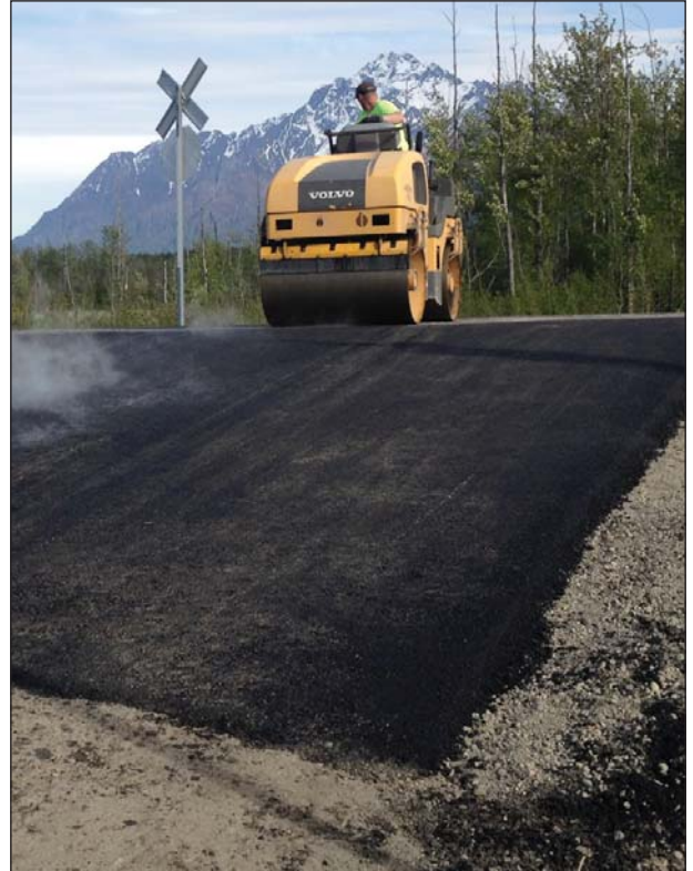
The Matanuska Spur Road crossing is paved after crossing improvements are completed in 2014-2015.