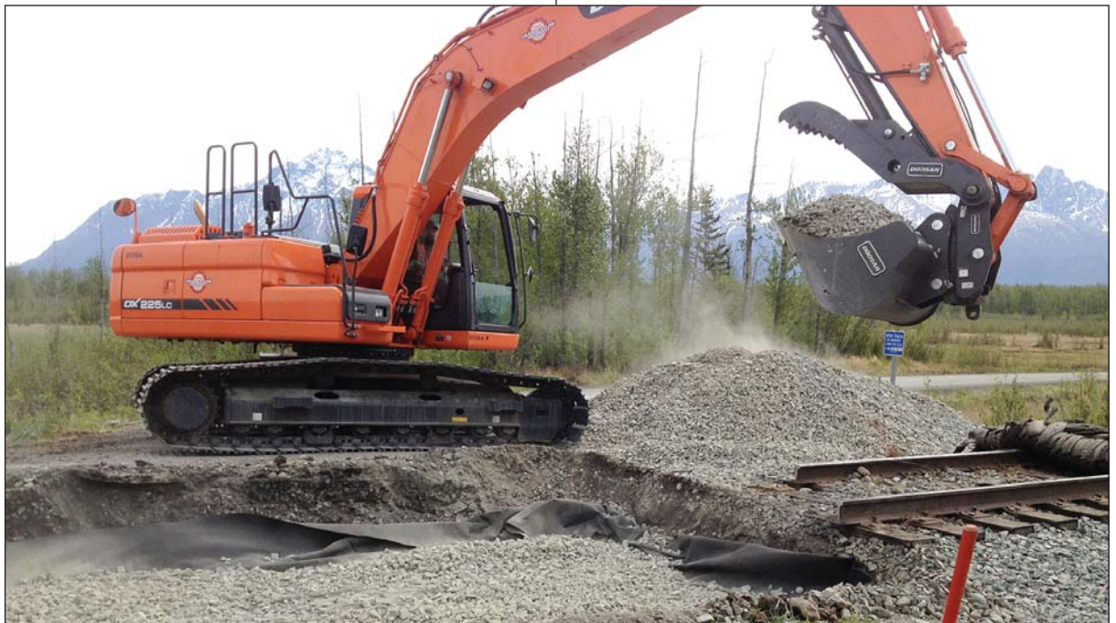
Crossing upgrade work in 2014 on Matanuska Spur Road, less than a mile east of the Glenn / Parks Hwy interchange.

In 2014, 10 crossings were upgraded railroad system-wide (Seward to Fairbanks) including four upgrade projects within the Mat-Su Borough – at Fireweed (Glenn Hwy Frontage) Road near the Glenn/Parks interchange; at Matanuska Spur Road; at Fairview Loop Road near the intersection with Old Matanuska, and at Fishhook-Willow Road in Willow. In 2017, $1.7 million in planned road/rail crossing upgrade projects throughout the Matanuska-Susitna Borough include: