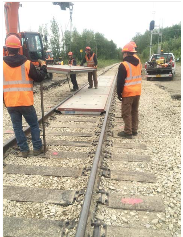
Concrete panels are placed at the crossing with Fairview Loop Road as part of an upgrade in 2014-2015.