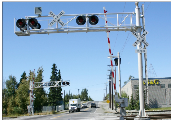
Automated wayside horns at Klatt Road crossing.

Railbelt communities statewide may determine local crossings that warrant installation of whistle noise reduction systems. Nationwide, these projects are typically pursued at the request of the community, with funding coming from municipal, borough, state and federal sources. Citizens interested in creating a Quiet Zone should first contact their local government transportation and community planning agencies with a request that they fund, or seek funding for, train whistle noise reduction systems.