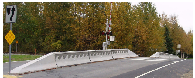
Median barriers at Oceanview crossing.