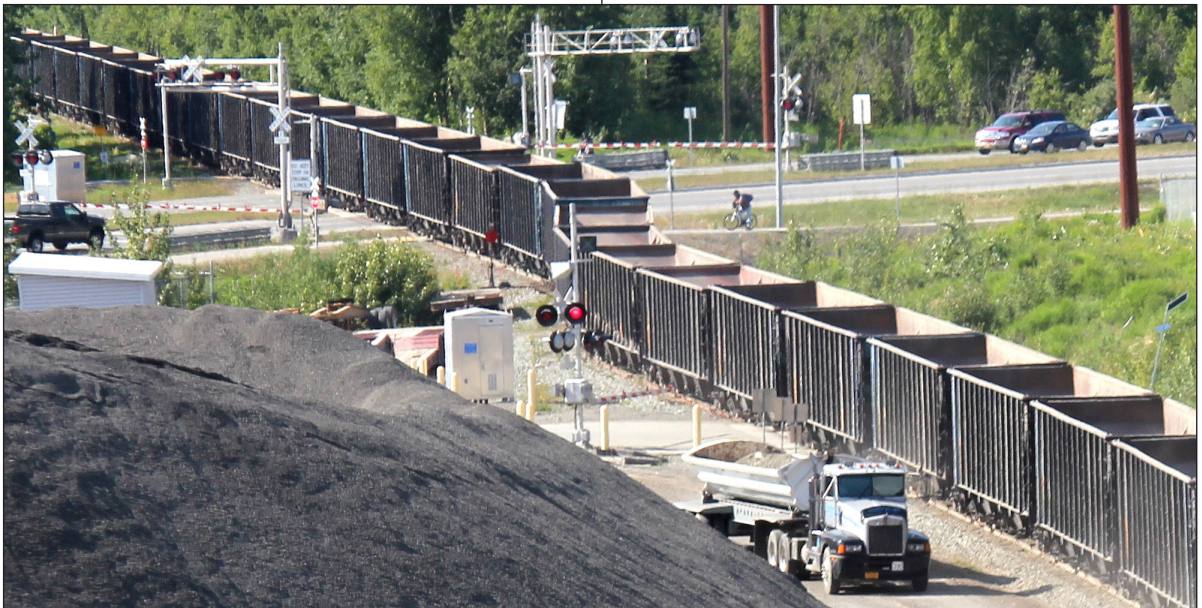
A gravel train travels crosses C Street.

At the C Street crossing, wayside horns were installed as a train whistle reduction system. The wayside horns meet federal requirements that allow the railroad to stop blowing train horns at