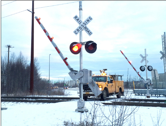
A gate has been installed at the railroad tracks crossing over a bike/pedestrian path running parallel to C-Street.

To improve pedestrian safety at the C Street pedestrian pathway crossings, the Alaska Dept. of Transportation and Public Facilities (ADOT&PF) and ARRC installed crossing signals with gates on both pathways in 2015 – a Highway Safety Improvement Program (HSIP) funded project.