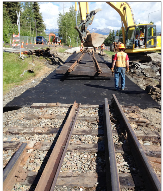
Crossing upgrade work at Alaska Landing in Anchorage in 2014.