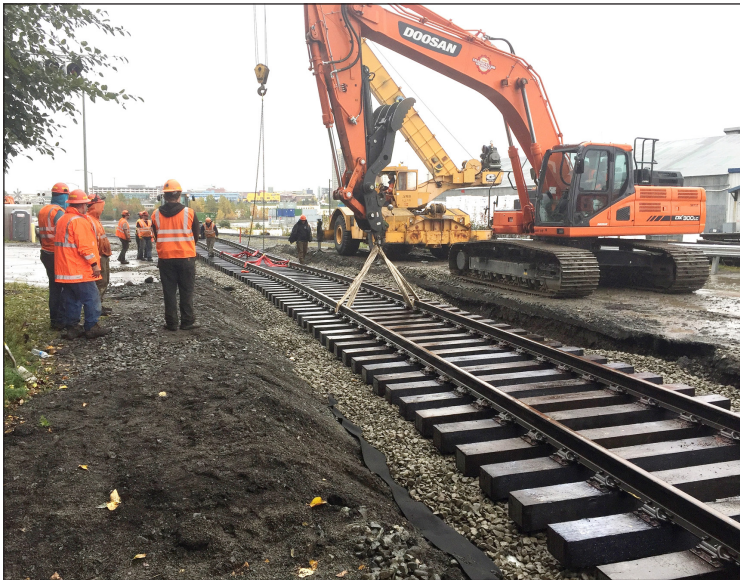
Crossing upgrade work at Ocean Dock Road in Anchorage in 2017.