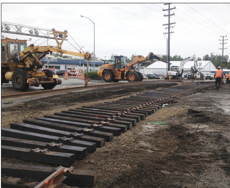
Crossing upgrade work at Post Road near the intersection with First Avenue in Anchorage in 2014.