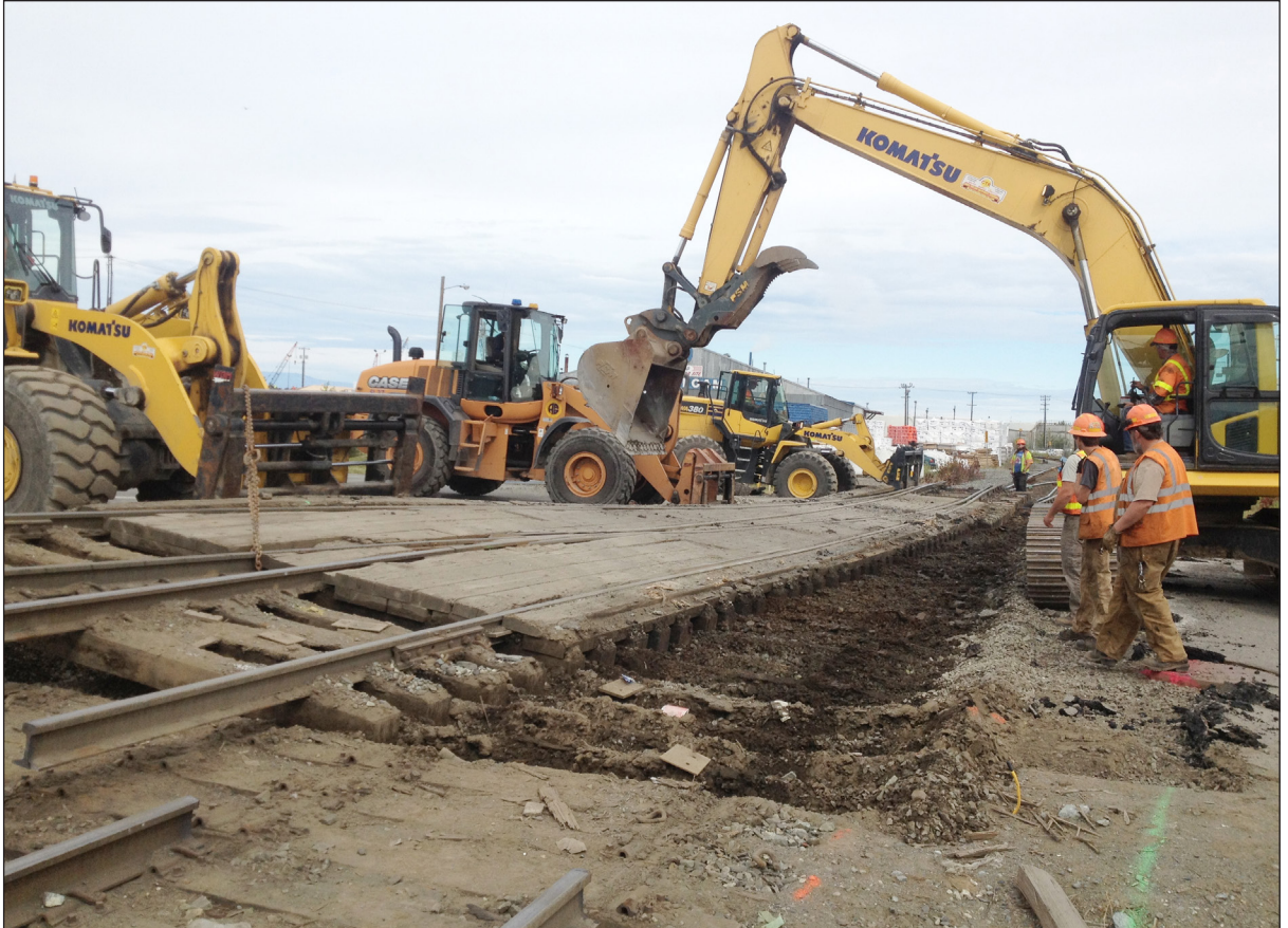
Crossing upgrade work is accomplished on Boat Launch Drive near the Port of Anchorage during 2014.

(MOA) Public Works Maintenance & Operations Division – regularly review the at-grade (road and rail at the same level) crossings for maintenance actions needed by both trains and vehicle traffic. As maintenance needs are identified, the agencies work together to fund and execute crossing surface upgrades which may include rebuilding the track, updating the surface panels, repaving the approaches, and re-stripping the crossing pavement markings.