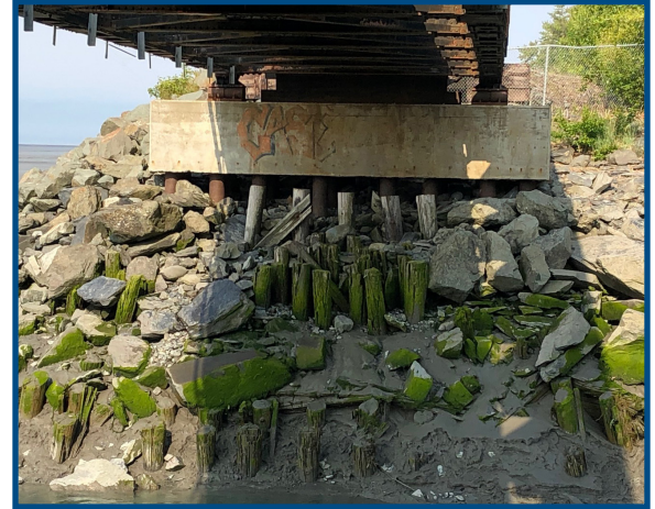
Top Left: A cross section of the proposed 125-foot through-plate girder bridge placed on the existing substructures. Top Right: An existing abutment.