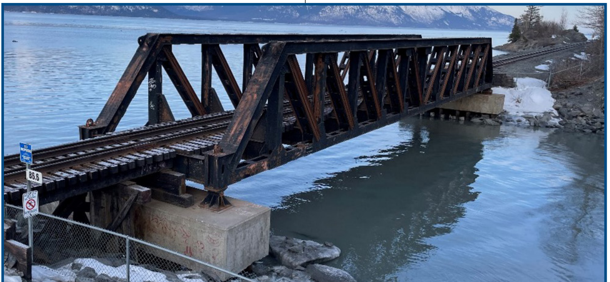
Bridge 86.6 crosses Bird Creek, just south of Anchorage.

For more project information or comment, email the Alaska Railroad at Public.Comment@akrr.com .