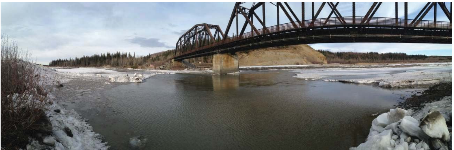
Looking north at the brige MP 370.7 over the Nenana River.