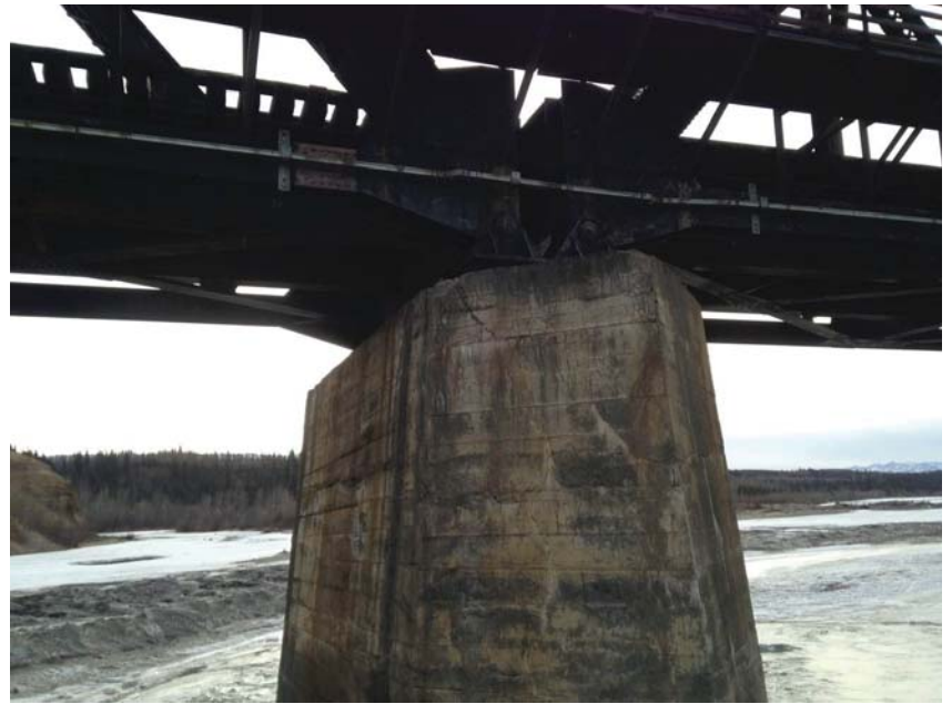
Bridge MP 370.7, Pier #3