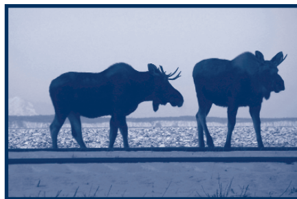
Moose walk alongside the track.

When feasible, the railroad hauls recoverable moose carcasses from roadless areas to road crossings for pickup. An estimated 50% to 60% of moose hit by trains are salvaged. ●