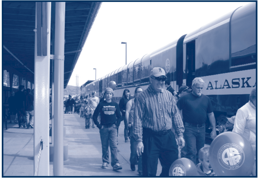
Fairbanks residents enjoy free train rides during the 2012 open house.

years, an open house will be held in Anchorage and during odd-numbered years, the open house will be held in Fairbanks. ●