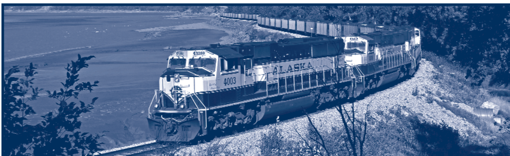
A southbound coal train moves along Turnagain Arm.