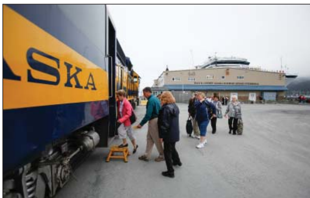
The West Dock accommodates thousands of passengers who arrive in Alaska via cruise ships. Many of these visitors elect to use rail to travel to other Alaska communities along the rail belt.