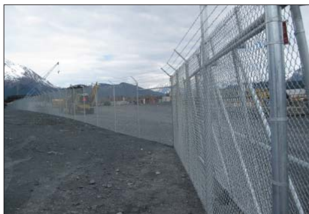
On the west side of the terminal, a new 6-foot fence will be erected and link to an existing fence along the East Dock.

tivity. New fencing on the west side of the West Dock will connect to existing fencing along the Loading Facility Dock and a pedestrian pathway, which was installed in 2004. New fencing on the east side of the West Dock will connect to security fencing installed along the East Dock in 2011. Funding is from a federal Department of Homeland Security $295,000 Port Security Grant (PSG). Another $80,400 PSG will fund upgraded video surveillance cameras at gates.