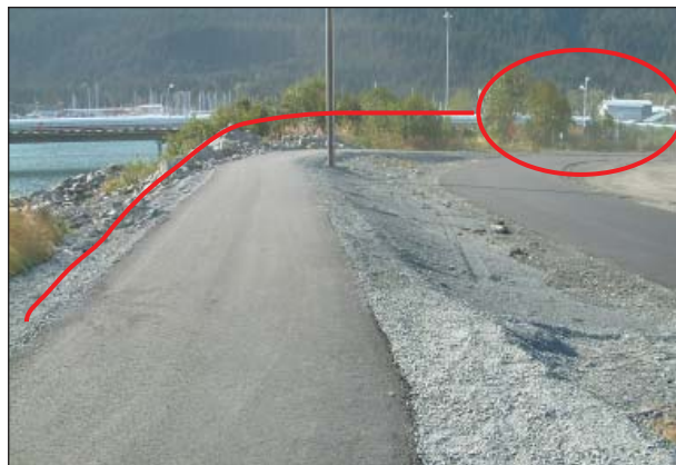
On the terminal's east side, a new 6-foot fence will be erected and linked to an existing fence along the Loading Facility Dock.