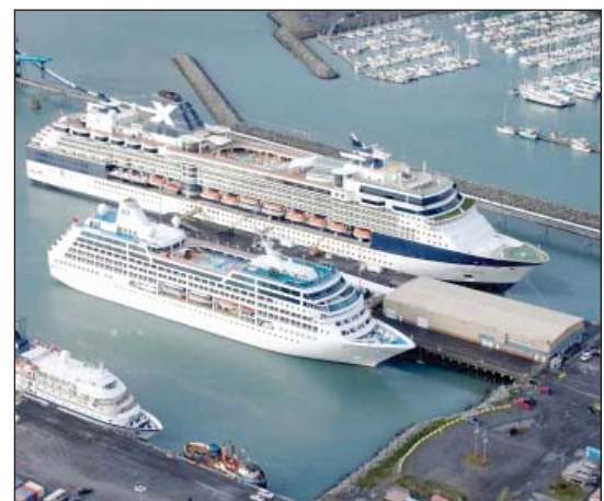
Two cruise ships dock at the West Dock.