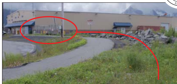
The existing gates on either side of the terminal will be replaced with automatic roller gates equipped with card reader controls. New 6-foot fencing will connect to the gates.

New fencing to be installed in on either side of the West Dock will fill a gap in security fencing around the railroad's three docks.