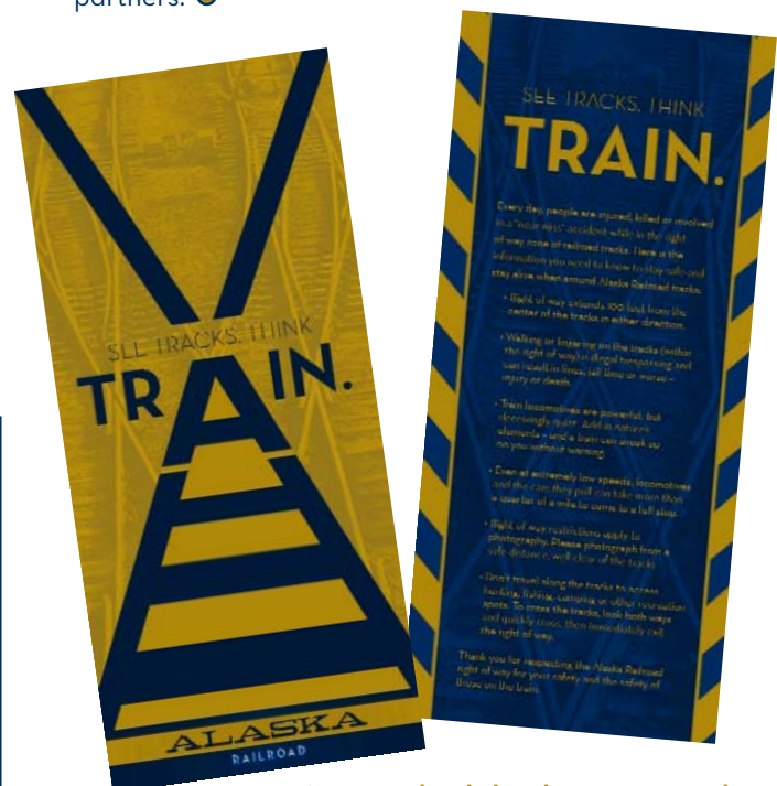
A new card-style brochure promotes the Operation Lifesaver message: "See Tracks. Think Train." Developed for the Railroad's 2015 Public Safety Campaign, it is also available as part of the enhanced 2016 campaign.