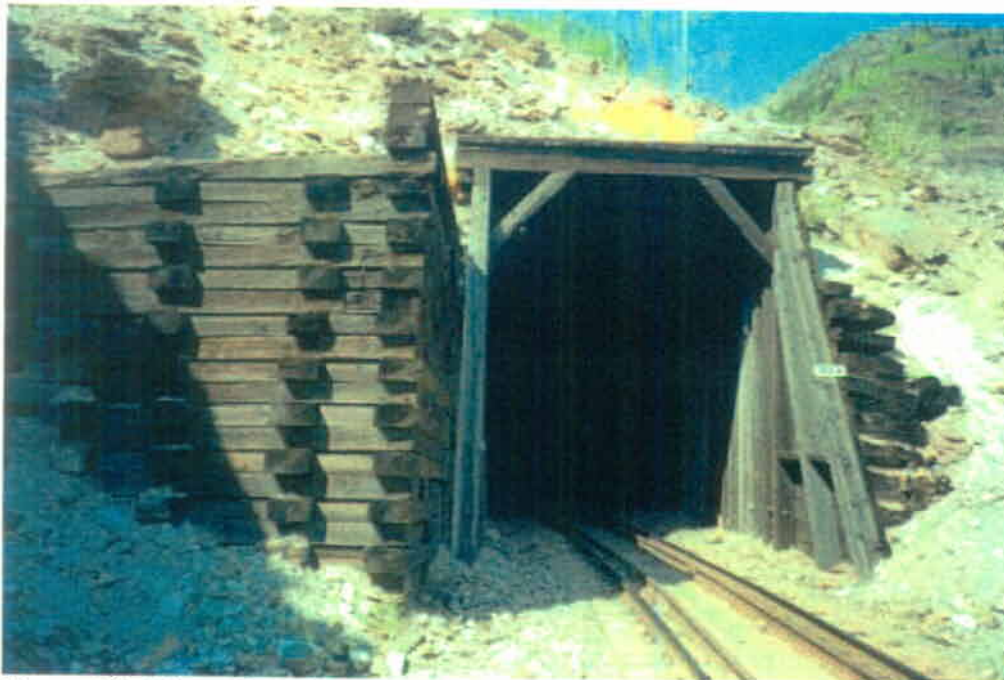
Figure A3. View of south portal of Moody tunnel looking north.