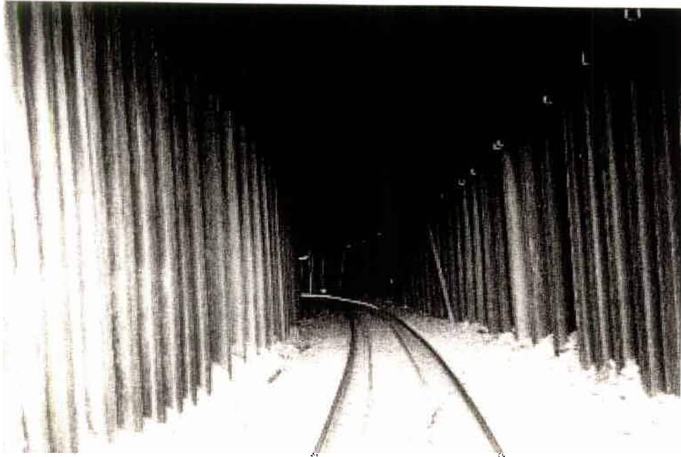
Figure A4. View of the interior of Moody tunnel looking north.