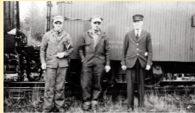
TRAIN CREW CIRCA 1950's

As a responsible partner, in order to accomplish the ambitious goals we set out for ourselves in conjunction with those of others along the railbelt, the ARRC must be a safe, secure, customer responsive, financially and environmentally sound, employee friendly corporation. We must provide a stable, reliable foundation that can be counted on to enhance the future economic growth of the state and the municipalities we support. If our corporate foundation is not sound, support for further state growth and development becomes problematic at best. Values and high standards are the building blocks of that foundation.