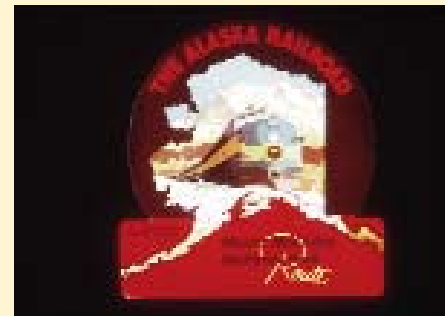
OLD “STEAMER” TRUNK LOGO CIRCA 1950’S