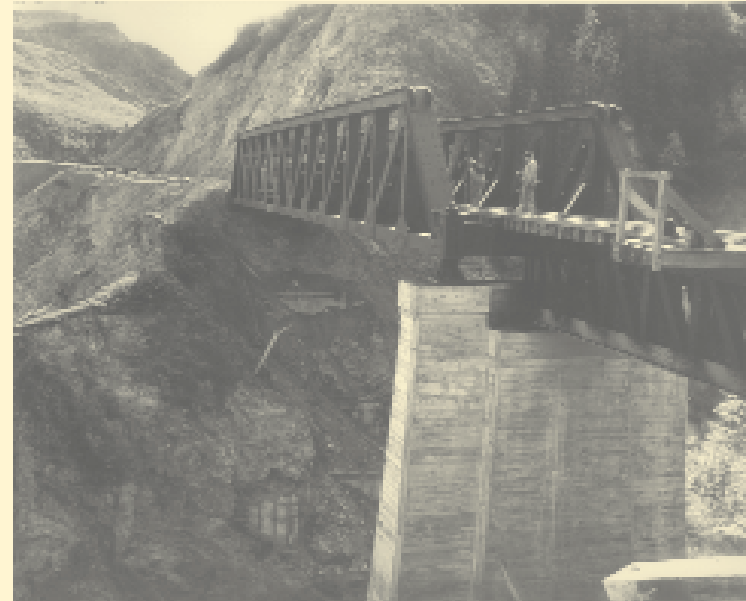
BRIDGE AT MILE POST 355.0 SINCE REPLACED WITH CULVERT IN 1991