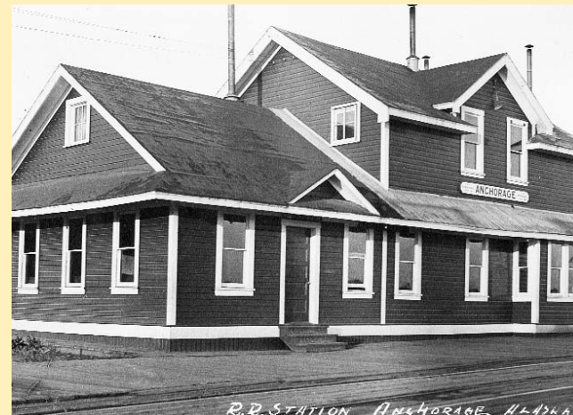
ORIGINAL ANCHORAGE RAILROAD STATION CIRCA 1930