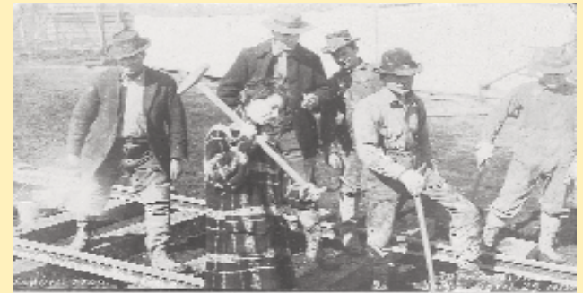
DRIVING THE “FIRST” SPIKE APRIL 29, 1915