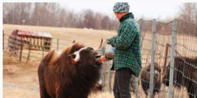
Musk Ox Farm, Palmer, Alaska.

Travel to the port town of Whittier to embark on a small boat glacier cruise in famed Prince William Sound, watching for abundant glaciers and marine wildlife.