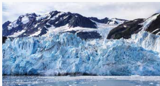
Prince William Sound, Alaska

Gear up with ice cleats for a guided exploration of Matanuska Glacier, Alaska's largest glacier accessible by road.