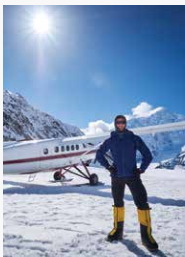
Ruth Glacier, Denali National Park.

Take to the skies for a stunning view of the Alaska Range and North America's tallest peak: Denali.