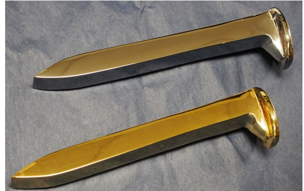
Silver and gold plated railroad spikes are part of ARRC’s Spike Award program.

Below are the 2020 Alaska Railroad Gold Spike Award winners.