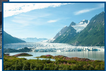
Left: Bridge 54.1 crosses the Placer River downstream of Spencer Lake and Spencer Glacier. Right: Spencer Glacier and Spencer Lake.