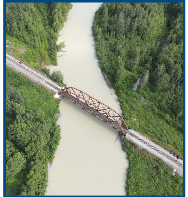
Kashwitna River erosion at MP 199.0.