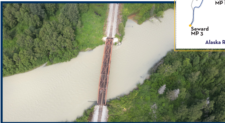
River eddying along the north abutment of bridge at MP 199.0 that crosses the Kashwitna River.