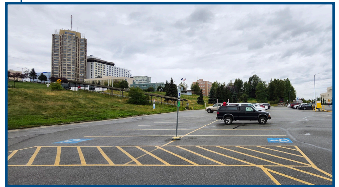
The Anchorage Historic Depot parking lot located in Anchorage, Alaska.