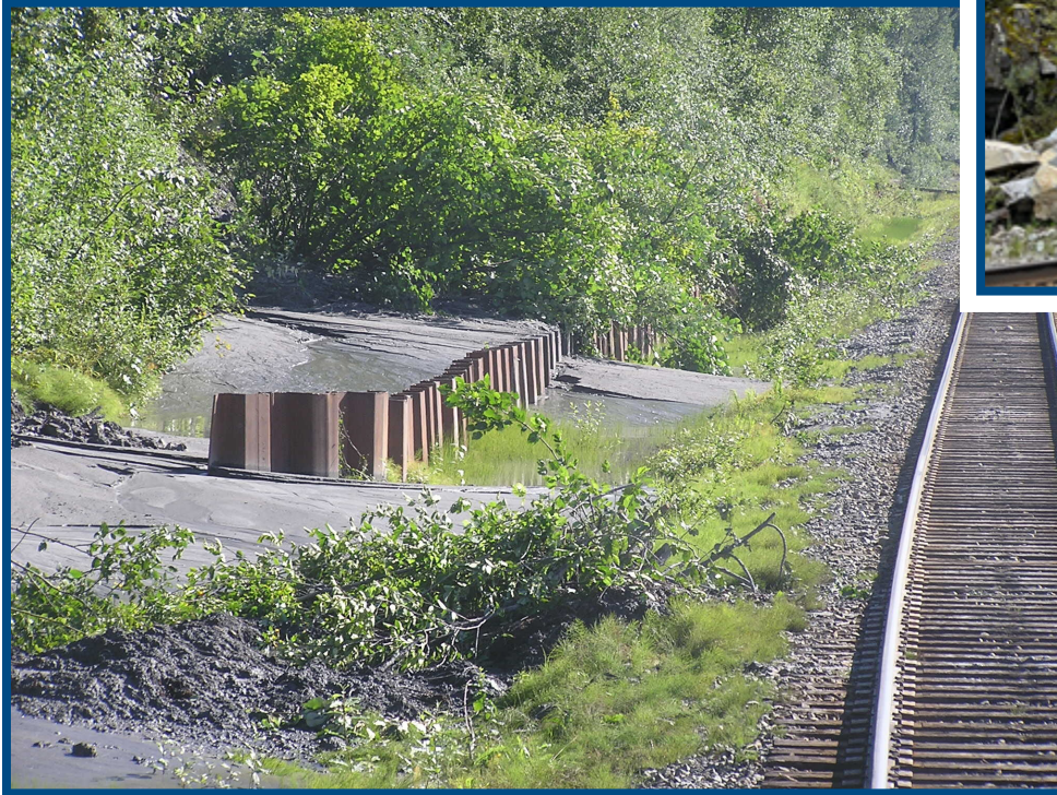
Previous slides north of Talkeetna.