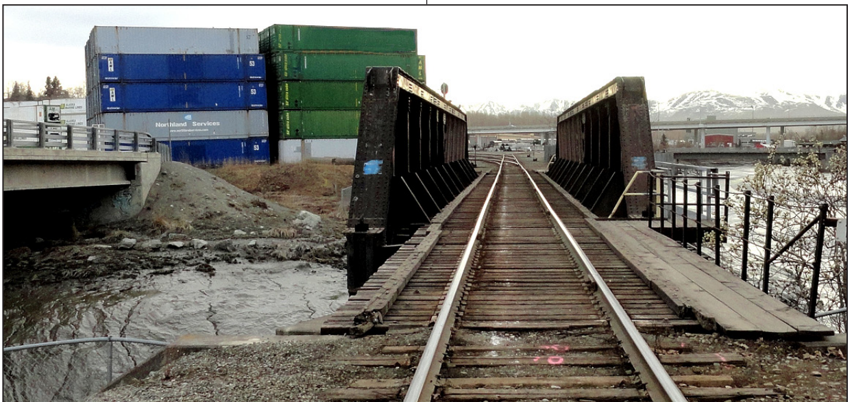
Bridge 114.3 crosses Ship Creek in an industrial area of lower downtown.