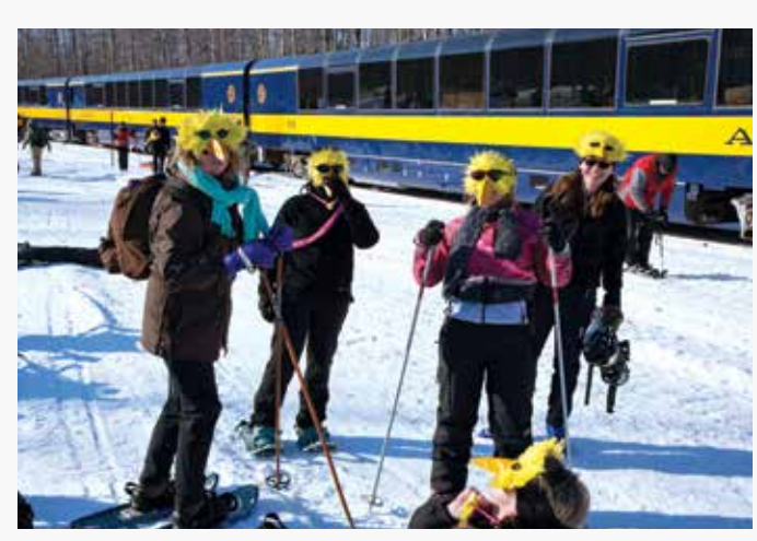
*No Hurricane Turn service in March; see Aurora Winter Train schedule.

Due to the nature of flagstop service, times may vary. Baggage service provided in Anchorage only. Wheelchair access provided in Anchorage, Wasilla and Talkeetna. Runs first Thursday of the month, October to May (Excludes March 6, 2025). No dining or beverage service onboard. Please bring your own food and drinks with you. To confirm the most current schedule information, visit AlaskaRailroad.com/Schedules .