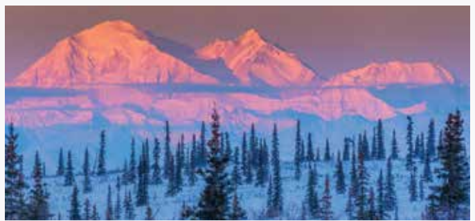
Denali National Park

Travel to the famed Denali National Park and Preserve on a guided day-trip from Fairbanks. See page 12 for more details.